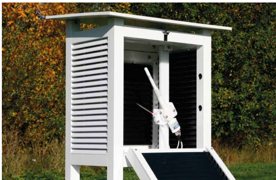
HMP155 with an additional temperature probe and optional Stevenson screen installation kit.